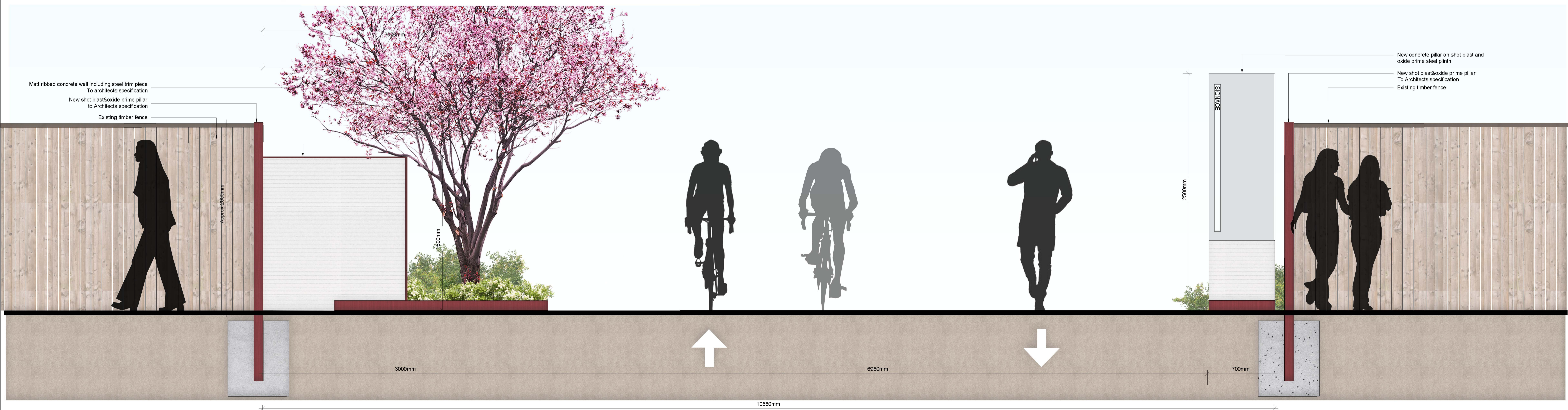
2 Elevation- Proposed access from Glanamuck Rd. scale 1:20 @A1